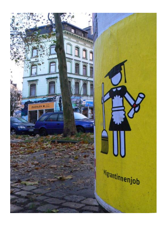
Figure 1. Pictogram poster developed by the project "Bundesmigrantinnen – Images of Migration in Germany's Urban Space"

In this article we have only been able to briefly touch on some dimensions towards an understanding of sustainable creative cities. We explored how contemporary critiques of the concepts of creative city and creative class , when placed in the context of the analysis of a culture of unsustainability, helps to highlight how the concept of creative cities may breed unsustainability. Using the cities of Hamburg and Toronto as examples, we proposed a re-conceptualization of creative cities based on an understanding of the role of the artist in cultures of sustainability. Richard Sennett's notion of the craftsman provides one pathway in this re-thinking process towards sustainable creative cities. Further key issues should be explored such as the question of how to become "skilled practitioners of interdependence" (see Kelley 2008, pp. 73-76) and necessary policy changes, such as rethinking Local Agenda 21 (see Kagan & Sasaki 2010; Kagan 2010b).